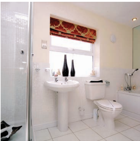
Photographs depict typical Bellway interiors from previous developments